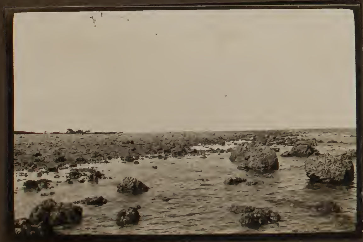
Boulders at low tide